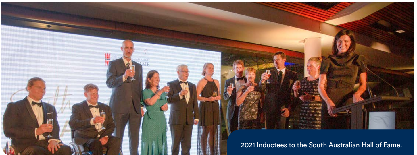
2021 Inductees to the South Australian Hall of Fame.