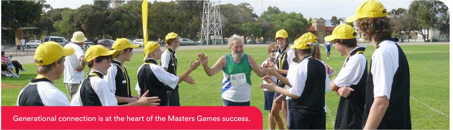
Generational connection is at the heart of the Masters Games success.