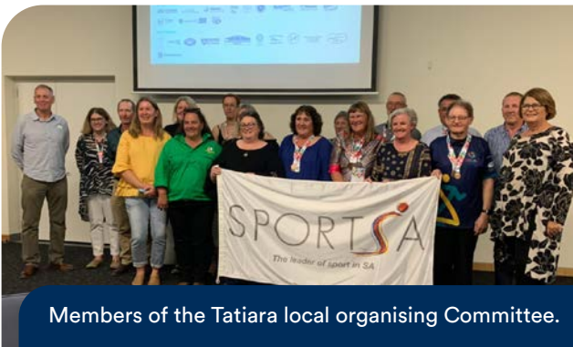
Members of the Tatiara local organising Committee.

The South Australian Masters Games is promoted to create significant return on investment to the host Region, with its main purpose to serve as a tourism event. A good part of that return on investment came from the 700+ participants and visitors to the Tatiara who spent between 1,400 and 2, 100 nights in local accommodation, staying an average of 2-3 nights. With approximately 75% of these participants visiting from outside of our region, the event served as an excellent vehicle for the Tatiara to promote itself.