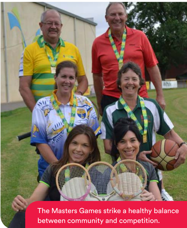
The Masters Games strike a healthy balance between community and competition.